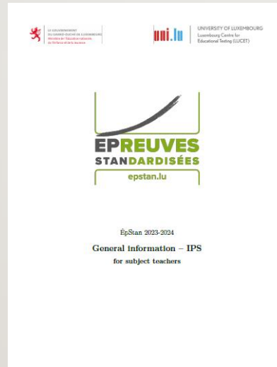
Information for subject teachers